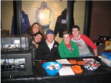
At a remote in the Bone