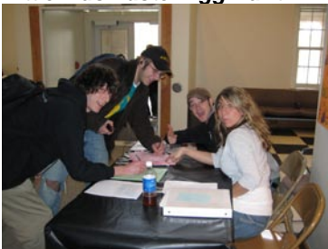
Food Fight II