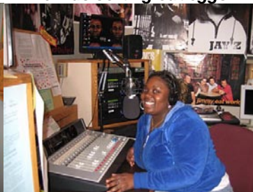
Having fun in the booth