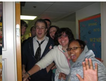
Ready for the "Big Kid" Easter Egg Hunt