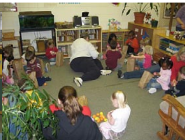
The kids sorting out eggs