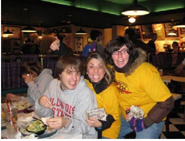
Z106 Street Team