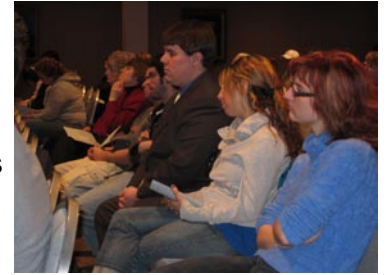
ZNDers listen to the speakers.