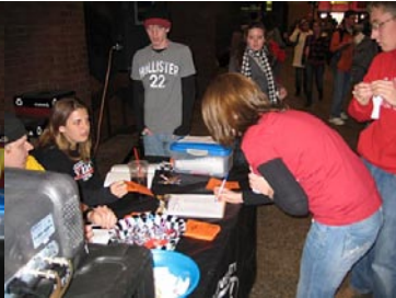
Listeners signing up to win