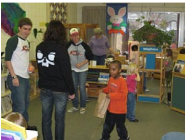
Little kids Easter Egg Hunt