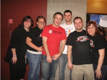
The Z106 Relay Team

Relay for Life, a fundraiser for the fight against cancer, is sponsored by the American Cancer Society. The ISU event took place inside Redbird arena this year due to inclement weather.