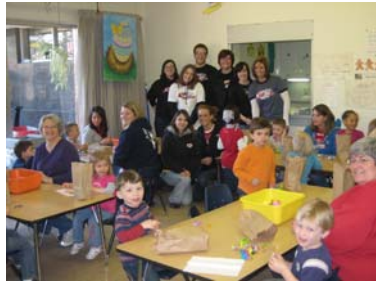
WZND Staff members with the children at the Spring Egg Hunt on April 1, 2009 at the ISU Child Care Center.