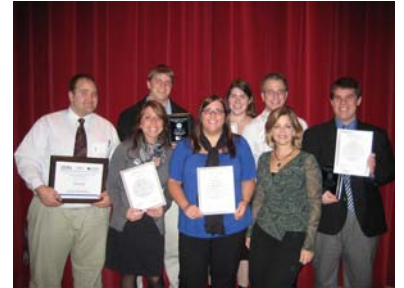
WZND Winners at the 2009 IBA-U Conference in the Bone Student Center